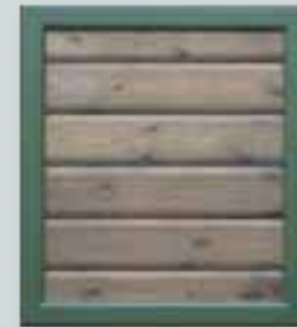
Cladding: Forest Green Trim: Evergreen