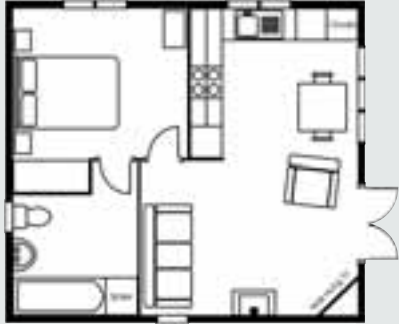
1 Bedroom, 1 Bathroom Lodge 22' x 20' (6.8m x 6.1m)