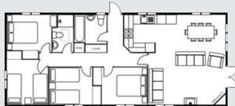
4 Bedroom, 2 Bathroom Lodge 47' x 20' (14.4m x 6.1m)