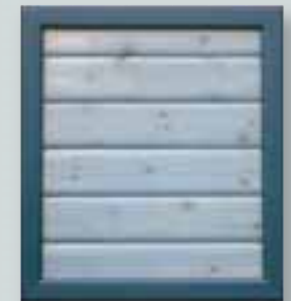
Cladding: Northern Pike Trim: Carolina Stone

The colours shown are printed as accurately as the printing process will allow.