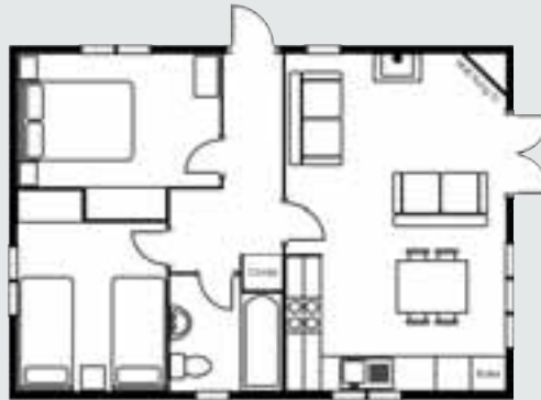
2 Bedroom, 1 Bathroom Lodge 28' x 20' (8.6m x 6.1m)