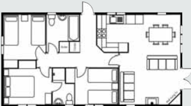
3 Bedroom, 2 Bathroom Lodge 38' x 20' (11.7m x 6.1m)