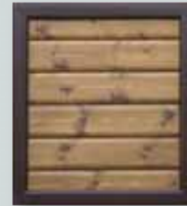
Cladding: Natural Forest Trim: Oaken