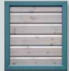
Cladding: Gregorian Grey Trim: Wild Thyme